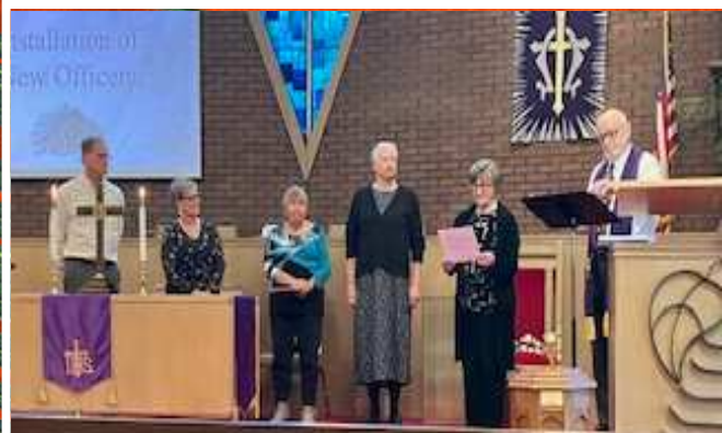
Installation of New Officers March 19, 2023